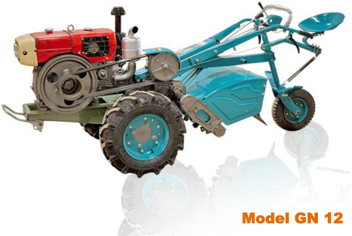
Model GN 12