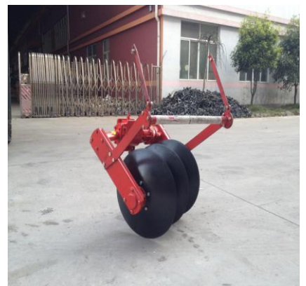
Driving Disc plough .