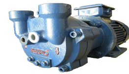
CDF1202 – 1402