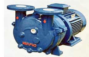
CDF2202 – 2212